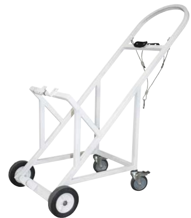
aXs2 lift kits with caddy options available