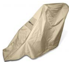
Splash!, aXs2, multiLift & ML300 920-5000T, AX9006, 500-5200T