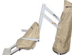
Seat Saver 970-5000T