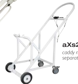
aXs2 caddy not sold separately