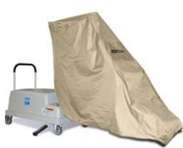
PAL Series 920-5000T

*Not applicable for ER or Hi/Lo | **multiLift Folding Seat Cover is blue.