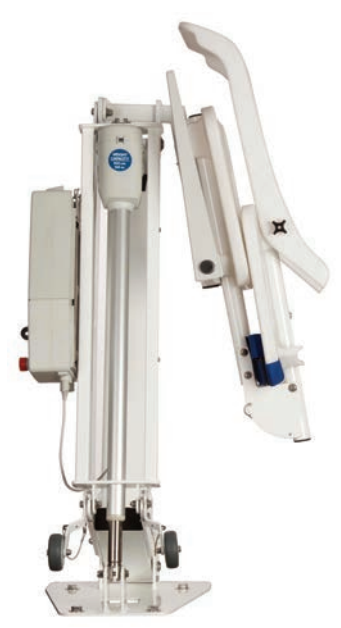
multiLift Optional Folding Seat Assembly (not available with fully rotomolded seat)