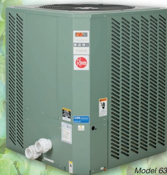
Model 6350ti shown

Rheem pool heater heat pumps are the only heat pumps manufactured by a major air conditioning company. Rheem HVAC product lines have successfully utilized heat pump technology for over 30 years. By taking our field proven technology and combining it with our industry leading pool heating products, we have developed a heat pump pool heater that is second to none. In the unlikely event that you have a service problem, one toll-free call will have your heater up and running again. It's that simple. Rheem heat pumps are truly hassle-free.