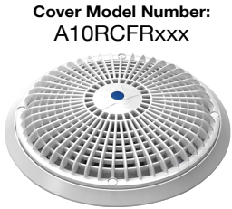
FIGURE 1 – SOFA MODEL & FLOW PATH

DIRECTIONS: Please follow the SOFA specific flow rates, sump specifications, and flow path zone information below. The installation must conform to these minimum/maximum requirements including the SOFA dimension defined in Figure 1. The flow path zone is defined by dimensions A through E. The installed sump may be manufactured or field-built and it may be larger/deeper than Figure 1. Please write the Cover Model Number, orientation, and SOFA Model Flow Rating on the VGBA DRAIN COVER IDENTIFICATION INFORMATION label that comes with each AquaStar Pool Products, Inc. drain cover.