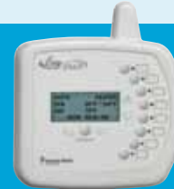
EasyTouch® Automated Controls