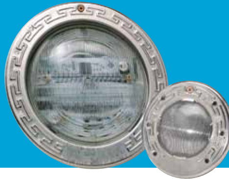
IntelliBrite 5g LED Pool Lights

IntelliBrite® 5g Underwater LED Pool and Spa Lights and IntelliBrite LED Landscape Lights are the most energy-efficient pool and spa lighting option available. Plus, they last longer than traditional halogen or incandescent lights, minimizing replacement cost and disposal.