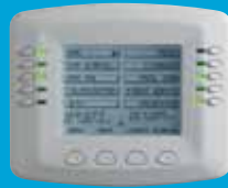
IntelliTouch® Indoor Control Panel