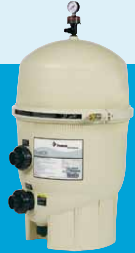
Quad D.E. Filters