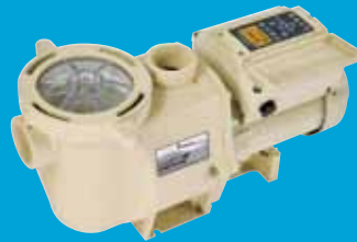
IntelliFlo vr Variable Flow Pump

Standard pool pumps can consume as much energy as all other home appliances combined—often costing more than $1,000 per year! IntelliFlo® and IntelliPro® Variable Speed Pumps can cut energy use up to 90%, saving an estimated $1,500* in utility costs annually—more where rates are higher than average.