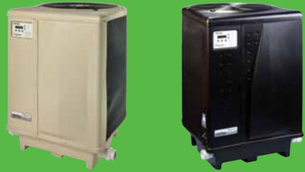
UltraTemp Heat Pumps

When a heat pump is appropriate for your climate, it is the most energy-efficient heating option. The UltraTemp® Heat Pump transfers heat from the atmosphere to the pool or spa, saving up to 80% in energy costs compared to other types of heaters. Plus, it is charged with R-410A refrigerant, a non-ozone depleting refrigerant which is safer for the environment.