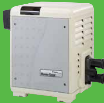
MasterTemp High Performance Heaters

MasterTemp® and Max-E-Therm® High Performance Heaters offer best-in-class energy efficiency. Plus, they are certified for low NOx emissions, making them eco-friendly favorites.