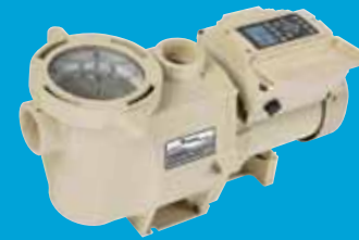
IntelliFlo Variable Speed Pump