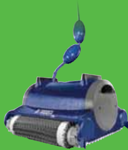
Kreepy Krauly Prowler 820 Robotic Pool Cleaner

The powerful Kreepy Krauly® Legend® II Pressure-side Pool Cleaner and Kreepy Krauly Prowler® Robotic Cleaners provide highly energy-efficient cleaning performance.