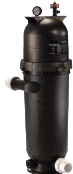
Posi-Clear RP Cartridge Filters