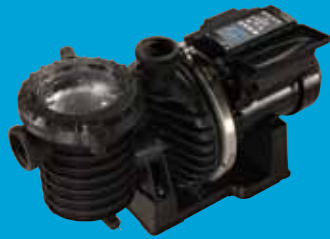
IntelliPro Variable Speed Pump