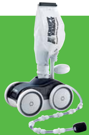
Kreepy Krauly Legend II Automatic Pool Cleaner