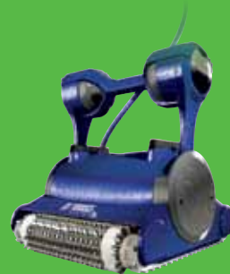
Kreepy Krauly Prowler 830 Robotic Pool Cleaner