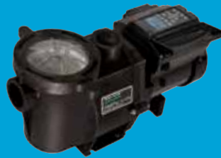
IntelliPro vs+SVRS Variable Speed Pump