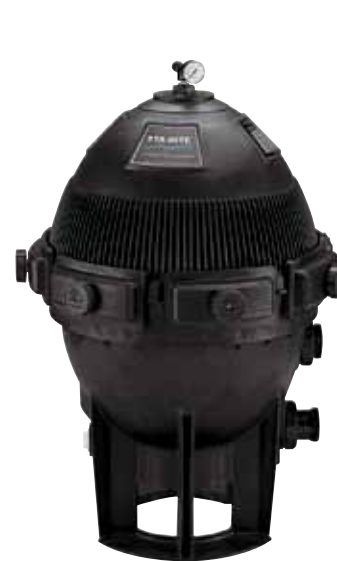
System:3 Mod Media Cartridge Filters