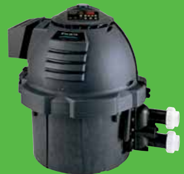
Max-E-Therm High Performance Heaters