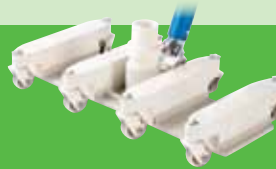
ProVac II Flexible Vacuum