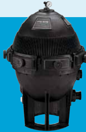
System:3 Mod D.E. Filters

Water flows very efficiently through Quad D.E.® and System:3® Mod D.E. Filters, allowing the use of smaller pumps or lower pump speeds to minimize energy use. And when you rinse cartridges rather than backwash, you can significantly reduce water use, too.