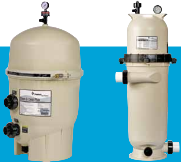
Clean & Clear Plus Cartridge Filters

Water flows very efficiently through the Clean & Clear® Plus, Clean & Clear RP, System:3 Mod Media and Posi-Clear™ RP Cartridge Filters, often allowing the use of smaller pumps or lower pump speeds to minimize energy use. Plus when you rinse cartridges rather than backwash, you can significantly reduce water use, too.