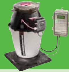
IntelliPH Chemical Controller