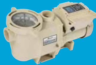
IntelliFlo vs+svrs Variable Speed Pump