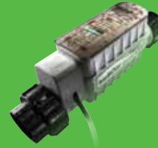
IntelliChlor Salt Chlorinator