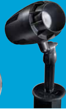
IntelliBrite LED Landscape Lights