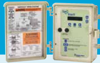
SunTouch® Automated Controls