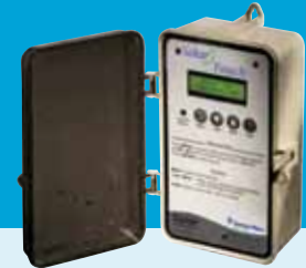
SolarTouch™ Solar System