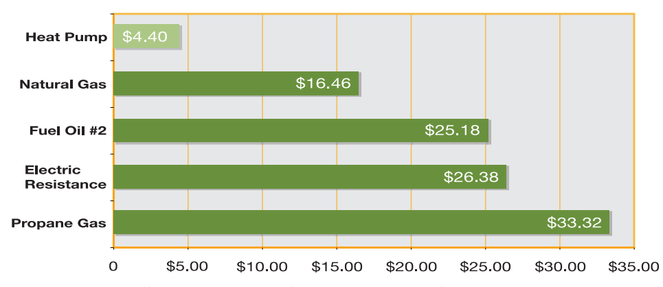
Chart based on $1.35/Therm natural gas, $2.50/gallon propane gas, $2.75/gallon heating oil, 9 cents/kilowatt