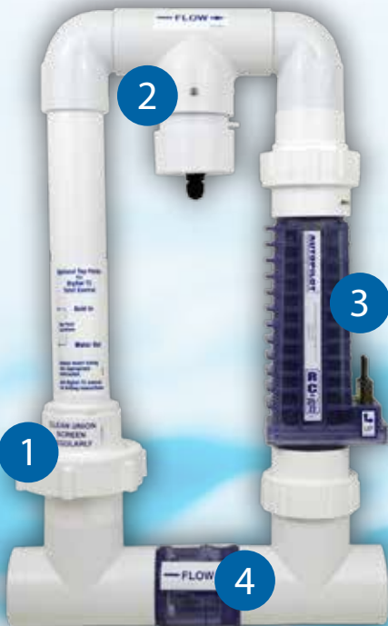
1. In-Line strainer 2. Tri-sensor 3. Chlorine production cell 4. Check valve