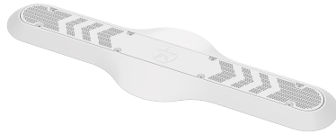
FIGURE 1 – SOFA MODEL & FLOW PATH