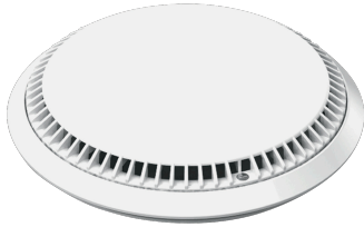
FIGURE 1 – SOFA MODEL & FLOW PATH