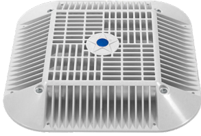
FIGURE 1 – SOFA MODEL & FLOW PATH