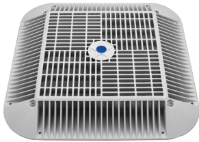
FIGURE 1 – SOFA MODEL & FLOW PATH