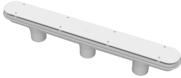
FIGURE 1 – SOFA MODEL & FLOW PATH