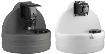
7.5-Gallon (28.4 Liters)