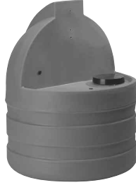
15-Gallon (56.8 Liters)