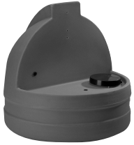
7.5-Gallon (28.4 Liters)