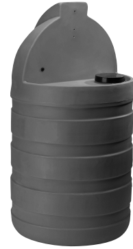
30-Gallon (113.6 Liters)