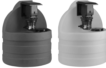
15-Gallon (56.8 Liters)