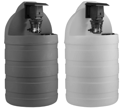
30-Gallon (113.6 Liters)