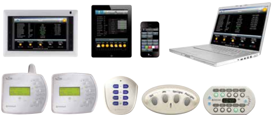
Photos show range of control devices available to interface with EasyTouch systems—wired, wireless, push-button or touch screen—all are extremely easy to use.