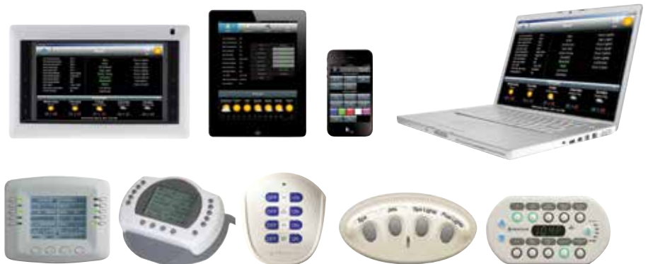
Photos show range of control devices available to interface with IntelliTouch systems—wired, wireless, push-button or touch screen—all are extremely easy to use.

For an overview of all the available ScreenLogic interfaces, see page 10.