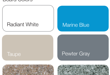
Actual product colors may vary.

All installations must comply with all applicable local and national codes and installation must be completed in accordance with S.R.Smith installation instructions.