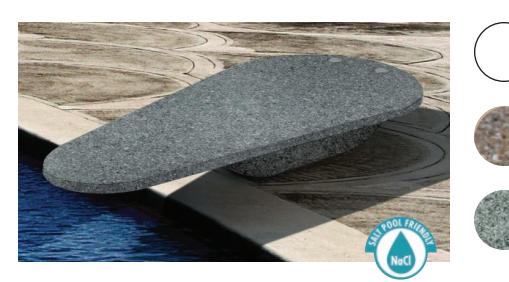
FreeStyle<sup>™</sup> on D-Lux Stand Will add a unique design element to your pool, with its widest point being twice the width of a traditional diving board. It comes with a matching D-Lux<sup>™</sup> stand.<sup>*</sup>