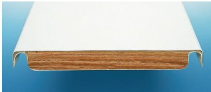
Frontier III Board