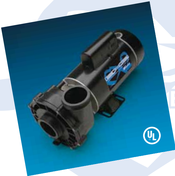
EX2 Performance Chart