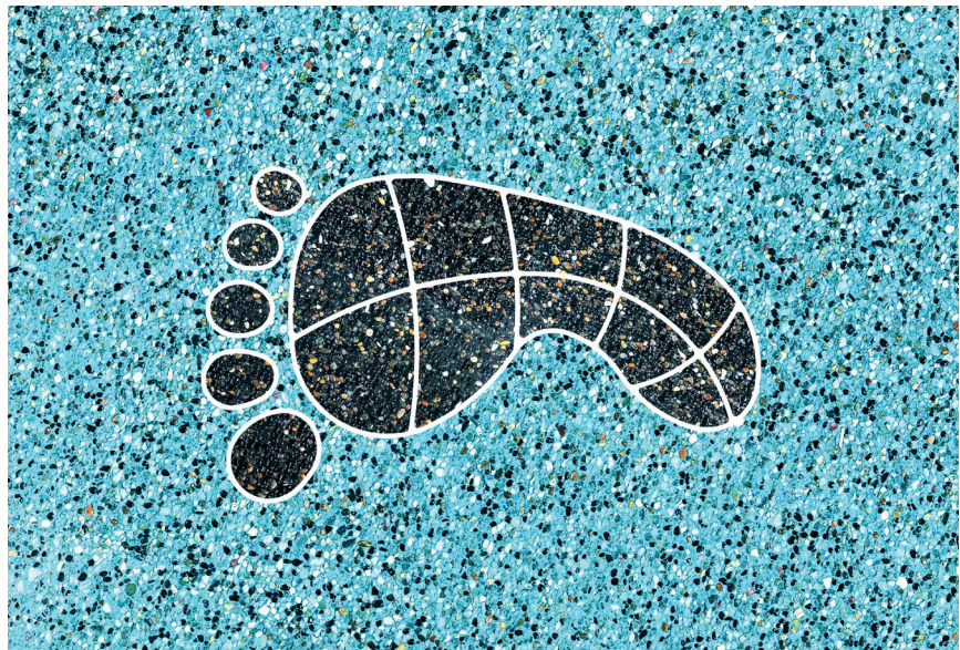
Part # F1020-xx