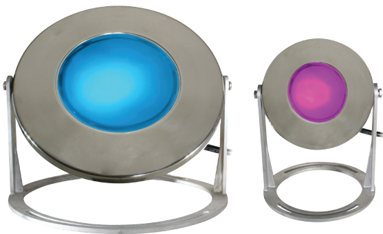
No Guard (stamped, polished bezel)

J&J Electronics, Inc. LED Underwater Fountain Luminaires offer a true LED lighting alternative for fountains, ponds, and reflection pools. Brighten up your water features' appearance with the cleaner and clearer look of our PureWhite™ Warm White or Cool White LED's. Or perhaps create a more custom color-rich appeal with the multiple colors and shows of our Color Splash® color changing LEDs. Our LED Underwater Fountain Luminaires create the ideal setting for any underwater environment while significantly reducing energy consumption and maintenance costs, compared to traditional light sources.