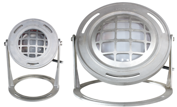
With Guard (casted, matte finish)