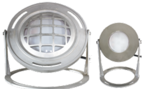
Large, with guard shown