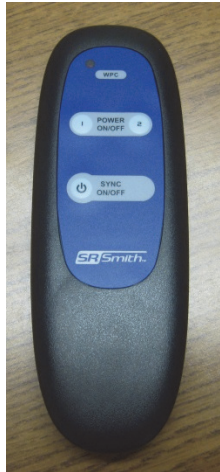
Hand Held Transmitter (Remote)

The 315MHz to 915MHz upgrade kit contains the three main components of the RF Remote Control System used in the 2-channel WPC1, WPC2, and PT-6000 products. All three parts are required to be replaced as a complete set. They are not compatible with any of the older 315MHz parts.