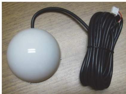
Antenna / Repeater

Side of housing includes a label to identify: • the operating frequency (915 MHz)