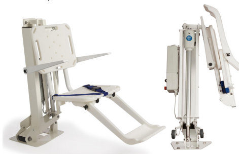
Optional folding seat assembly