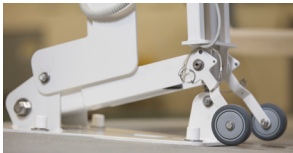
Wheel-A-Way mobility option provides flexibility to transport the lift if needed