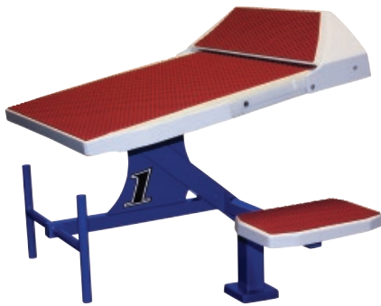
Velocity Side Mount