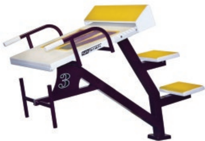
Legacy Launch Long Reach