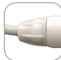
Aquabot Swivel. Helps prevent Cable tangling!