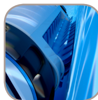
Hyper-Speed Scrubbing Brush. Moves 2x's faster than standard brushes.