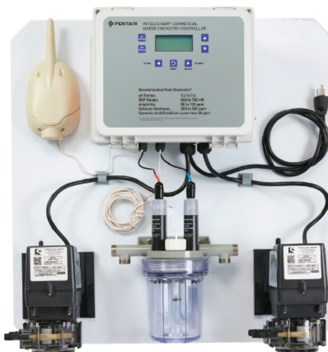
Plug & Play installation. Powerful chemical automation.