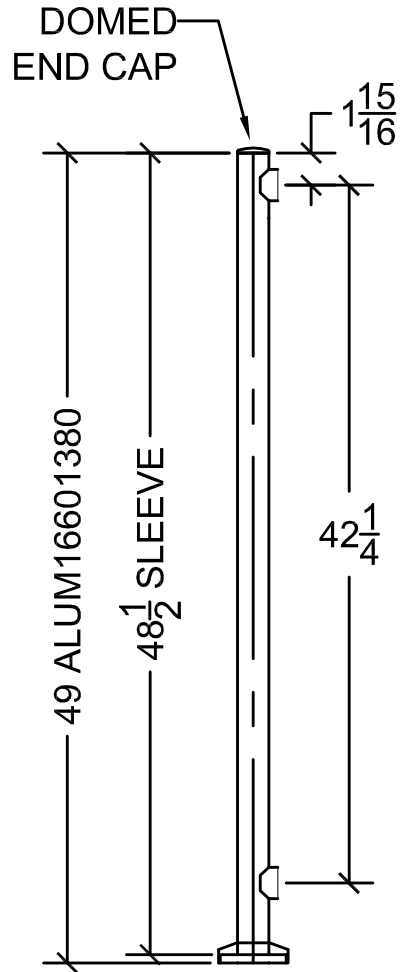
QTY: 2 PLATE COVER FP-2248-PEP

f:\saftron\load files\load copy_090331\drafting\05_catalog\safety rails\pool fence\2200 rail for 8 ft section\dwg\fs-2200-4896.dwg