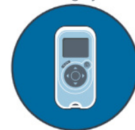
Remote control unit