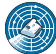
CleverClean scanning system