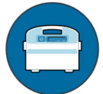
Filter indicator on power supply