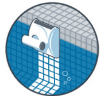
Water line cleaning