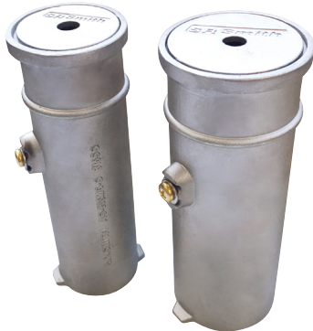
1.50" &amp; 1.90" Stanchion Anchors