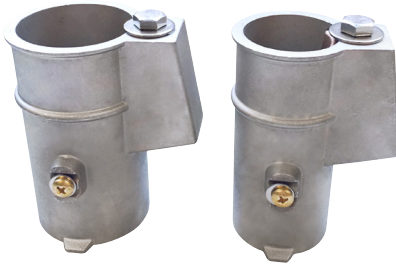
1.50" &amp; 1.90" Wedge Anchors