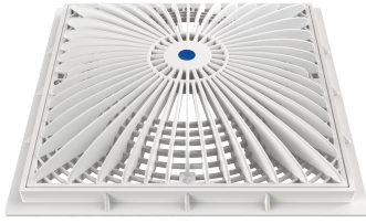
FIGURE 1 – SOFA MODEL & FLOW PATH