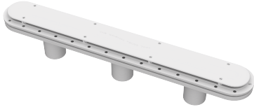
FIGURE 1 – SOFA MODEL & FLOW PATH