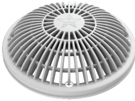
FIGURE 1 – SOFA MODEL & FLOW PATH