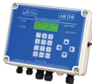
Acu-Trol AK110™ Aquatic Automation Controller