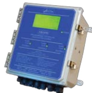
Acu-Trol AK600™ Multifunctional Equipment Room Controller

Acu-Trol®, Pentair Pool Products® Paragon Aquatics®, Stark™, Sta-Rite®, Berkeley®, Aurora®, AK110™, AcuPort™, AcuManage™, AKColor™, and AK600™ are trademarks and/or registered trademarks of Pentair Water Pool and Spa, Inc. and/or its affiliated companies in the United States and/or other countries. Windows® is a registered trademark of Microsoft Corporation. Unless noted, names and brands of others that may be used in this document are not used to indicate an affiliation or endorsement between the proprietors of these names and brands and Pentair Water Pool and Spa, Inc. Those names and brands may be the trademarks or registered trademarks of those parties or others.