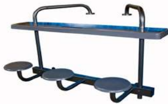
OVER THE EDGE