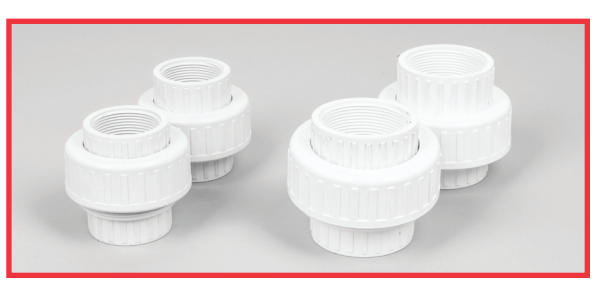
Union Connections (1-1/2" and 2" diameters)

E3T pool and spa heaters are compact, come standard with union connections, and are easy to install. They are the perfect solution for a new pool or spa, as well as to replace any existing pool or spa heater.