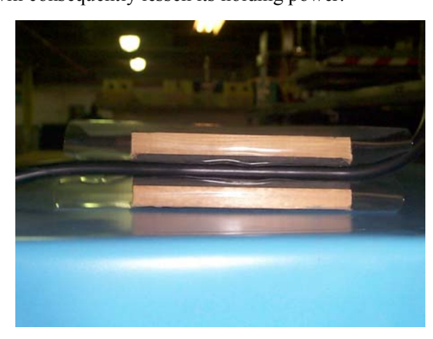
Fig. 9- Pull vinyl covering down as tightly as possible. Press vinyl lock over cover and into channel. Use no sharp or metal objects.

Unroll the black vinyl lock material around the entire enclosure. Beginning at any point, attach the cover to the extrusions and hold in place with the vinyl lock (black cord). After you have inserted about 4 or 5 feet of vinyl lock, move down about six feet and apply a slight amount of tension or stretch to the cord. Then tuck it into the extrusion so that it will hold. Now move another five or six feet and repeat this procedure all around the perimeter of the enclosure. Then follow up and tuck the remainder of the vinyl lock into place. See figure 9. DO NOT use any sharp instruments such as a screwdriver to assist in this operation. You should be able to do this with your fingers. If you need some assistance, a wooden paint stirring stick or something similar can be used-but be careful not to puncture or tear the cover. If the weather is cold, pour some very warm to hot water on the vinyl cover edge and the vinyl lock material. This will soften the materials and make the job much easier. Do not stretch the vinyl lock. Stretching its length decreases its diameter and will consequently lessen its holding power.