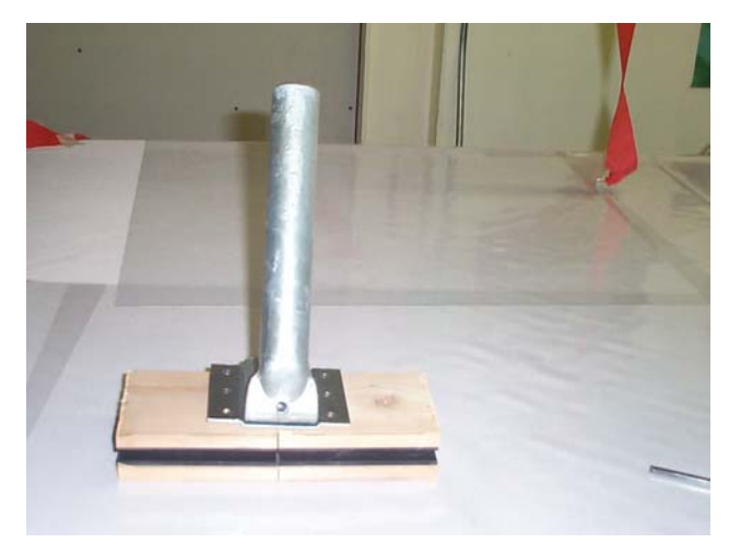
Fig. 3 . Notice that all hold down plates(part#060072) are flush with inner edge of foundation. Take care not to hit the locking extrusion with the fastening screws.

Mark location of brackets(part# 060052) on the side boards. Working from the left to right mark the location of the first bracket flush with the left end of the 2x4 foundation board. Next, using the spacing dimensions on the drawing mark the remaining locations of the brackets. The last bracket(right hand end) of each 2x4 board will center over the end of the plate. That is, it will actually rest on two boards- it will cover the joint. See figure 3.