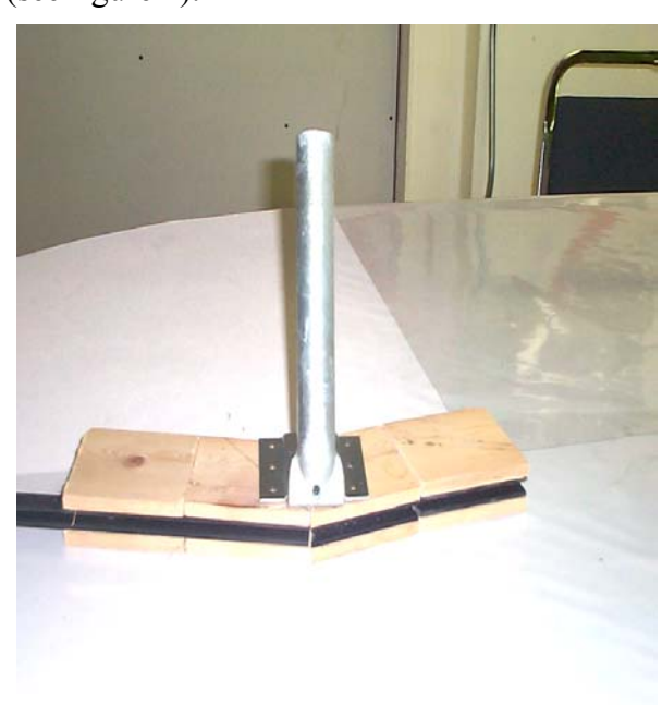
Fig.2-allow part 060052 to rest on 2x4

Mark locations of brackets(part 060052) and the end board( part 060072). One bracket should be flush with each end of the 2x4 and the remaining brackets should be equally spaced as shown (see figure 2).