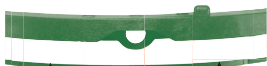
Close-up of Adapter Ring (Fig A). Used for Basket Models B-37 and 850001 Only.

Basket models B-37 or 850001 require the rim adapter (Fig A). Align the groove of adapter with handle location (as shown below) and press the ring into place until it clicks into position.