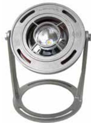
Cast Stainless Steel With Base Option