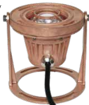
Cast Bronze With Base Option