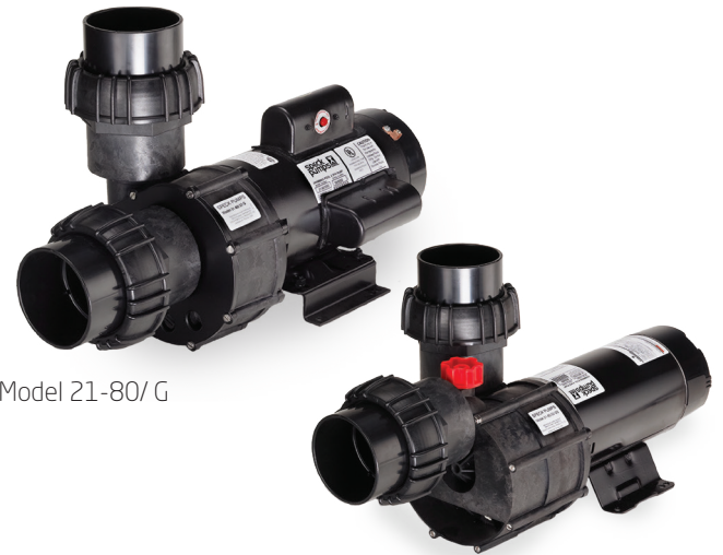
Model 21-80/ G