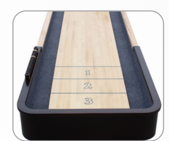
CARPETED GUTTERS AND SIDEWALLS