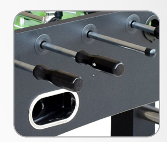
BLACK SOLID WOOD, EASY-GRIP HANDLES