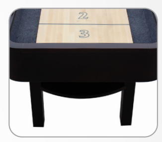
SOLID, HARDWOOD POST-STYLE LEGS