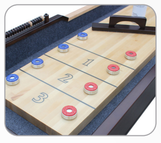
1.75-IN THICK BUTCHER-BLOCK PLAYING SURFACE

(8) shuffleboard pucks (4 red, 4 blue),(1) table brush, (1) can of wax and(2) abacus scoring units