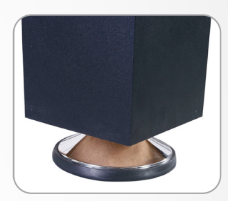
INDEPENDENT LEG LEVELERS