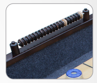
DUAL ABACUS SCORERS