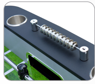
DUAL ABACUS SCORERS