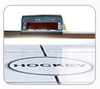
ELECTRONIC LED SCORING

(4) 4-in black strikers and (4) 3-in red pucks