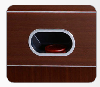
AUTOMATIC PUCK RETURN