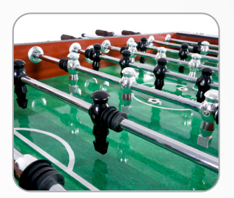
BLACK AND SILVER ABS PLAYERS