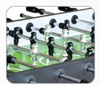
BLACK AND SILVER ABS PLAYERS