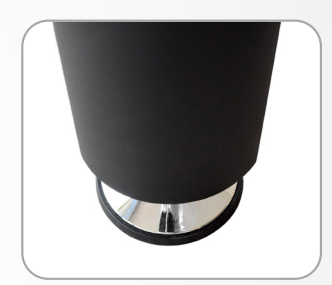
INDEPENDENT LEG LEVELERS