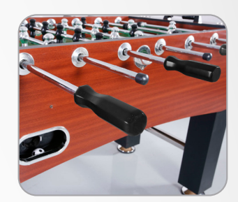
BLACK SOLID WOOD, EASY-GRIP HANDLES