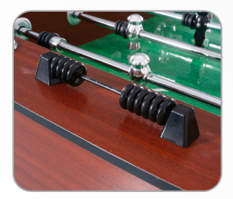
DUAL ABACUS SCORERS