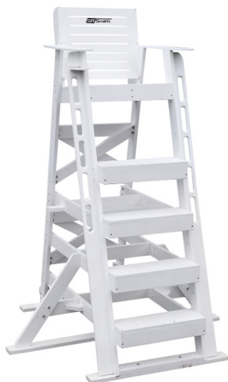
Sentry® 66" seat height lifeguard chair w/ center supports