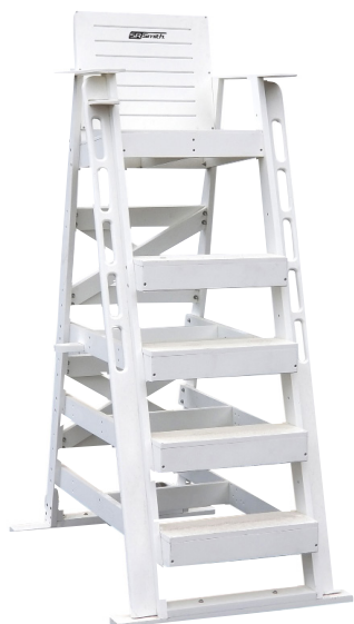
Sentry® 66" seat height lifeguard chair