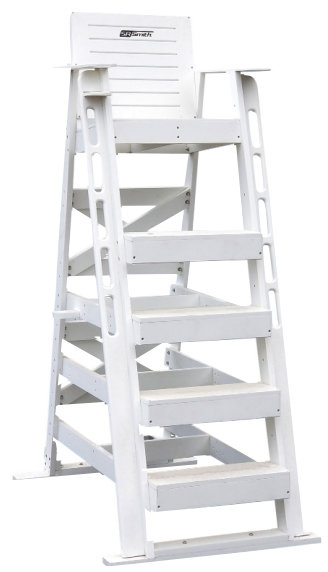
Sentry® 66" seat height lifeguard chair