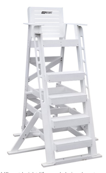
Sentry ^{\!\scriptscriptstyle B} 66" seat height lifeguard chair w/ center supports