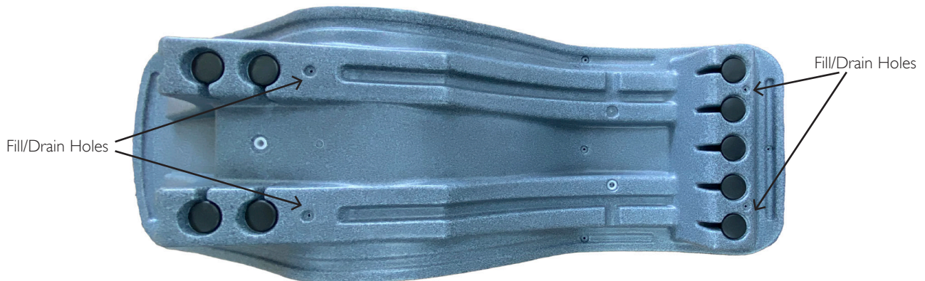
Figure 1 - Bottom of Lounger

NOTE: DO NOT DRAG OR SLIDE THE POOL LOUNGER ALONG THE VINYL LINER OR OTHER POOL SURFACES.