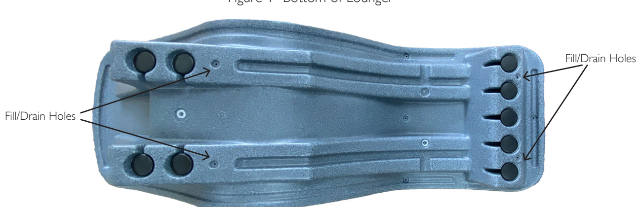
Figure I - Bottom of Lounger

Should you need to remove the Pool Lounger from the pool, it is recommended that you empy the water from the Pool Lounger first. With one person on each end of the lounger, lift the Pool Lounger above pool water level. You will see the water draining through the Fill/Drain Holes in select areas underneath the Pool Lounger. (See Figure 1)