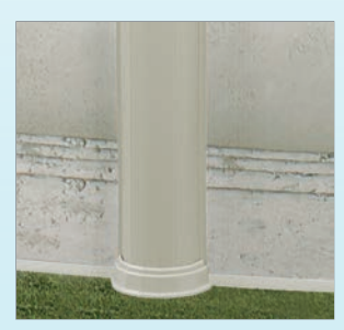
One-piece resin foot collar