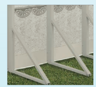
Heavy-duty angle brace system