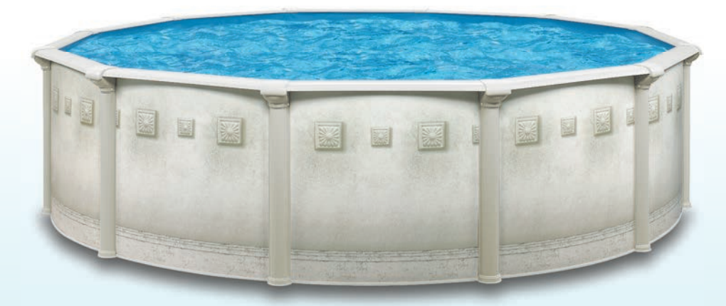
Round Millenium - Tuscan wall offered in 52 inches