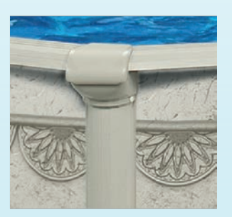
Ledge, cap and post designed for a secure fit