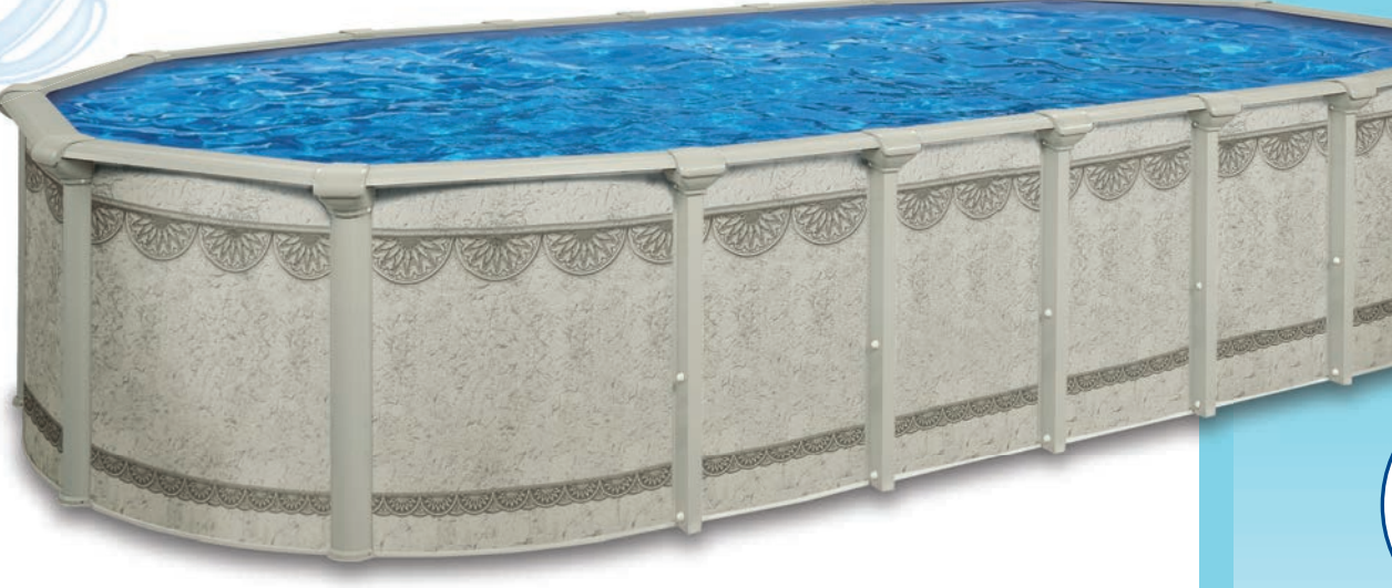
NBS oval Millenium - Khaki Maya wall offered in 52 and 54 inches