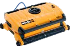
WAVE 300 XL Pools up to 154 feet

www.maytronicsus.com | T. 1-888-Dolphin • 770-613-5050 | F. 770-613-5099