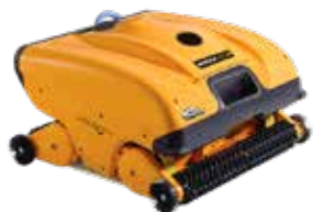
WAVE 200 XL Pools up to 105 feet