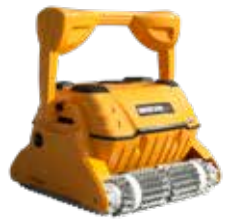
WAVE 100 Pools up to 88 feet