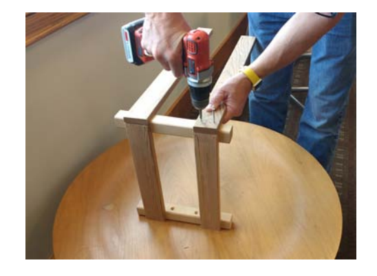
23. Prop up the pre-assembled portion and attach the two long horizontal pieces. Make sure the countersunk holes on the wall mounting bracket face inward.