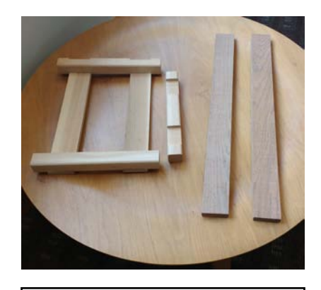
22. Your fence kit will arrive banded with stretch wrap. It consists of four pieces, shown here.