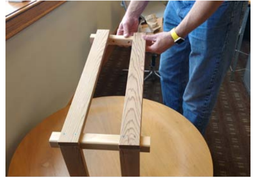
24. Attach the final piece—the remaining vertical fence post. When complete, position the fence around the heater and use the pre-drilled holes to attach it to the wall.