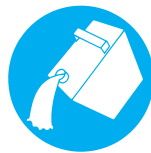
Clean Up Ramuc Thinner or Xylene