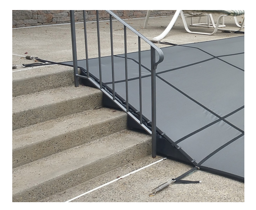
CUSTOM WEDGES - Steps and other features can leave exposed areas under the Safety Cover that can be accessible to debris and accidental intrusion. For these applications, GLI can provide custom wedges that will fit into place under the cover and provide an additional barrier of protection.