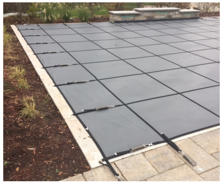
■ REDUCED DECK MOUNT SYSTEM - Limited deck space available? GLI's Reduced Deck Mount System (RDM) utilizes a patented design that allows for the use of full-sized springs to provide proper tension to your safety cover. Our RDM system is another addition to our vast portfolio of safety cover applications to fit your custom needs.