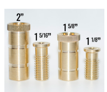
■ 2" Brass Anchors - Ideal for resurfaced decks that need longer anchors and are available in place of standard anchors.

■ 9" Paver Tubes & 18" Lawn Tubes - The 9" Paver Tubes are ideal for loosefitting patio pavers, while the 18" Lawn Tubes ensure your Safety Cover is an ASTM Certified installation when decking is not available. Both come with the brass anchor pre-installed.