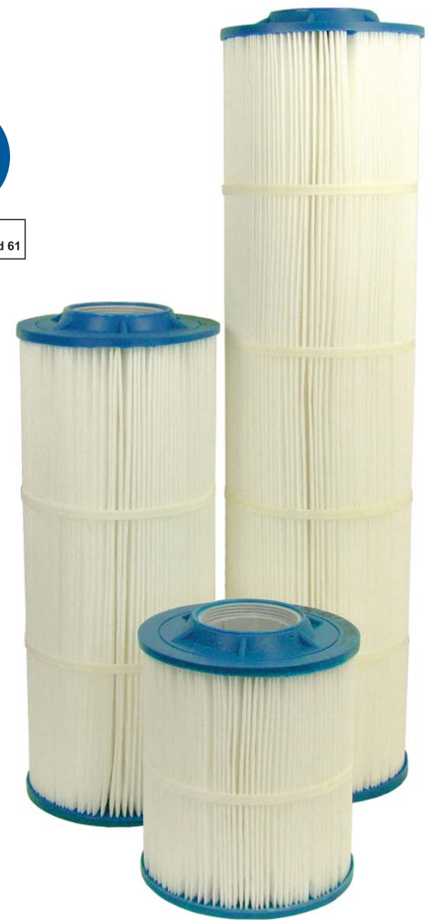
Premium Hurricane® Polyester Cartridges